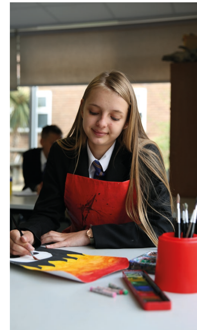
The Personal Development Curriculum is delivered on rotation.